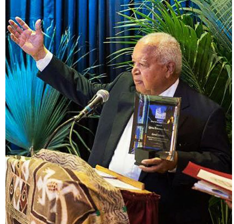
California-based Construction Contractors Alliance (www.ConstructionContractorsAlliance.org) raised the Gerald W. Johnson Scholarship to $2,500 per student to cover tuition for a National University online course in certified administrative assistant